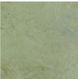
Cilantro AD605 LRV 38