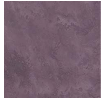
Lavanda AD952 LRV 10