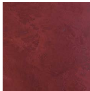
Sangria AD611 LRV 13