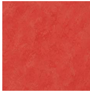
Picante AD950 LRV 18