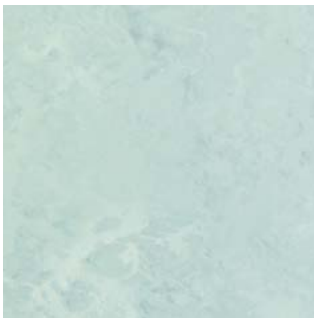
Cielo AD532 LRV 59