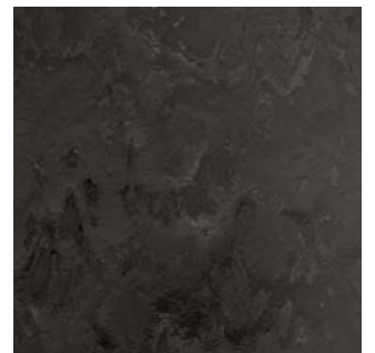
Noche AD504 LRV 10