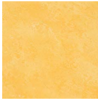
Plátano AD933 LRV 52