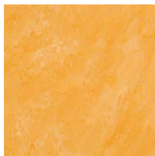
Marisposa AD934 LRV 43