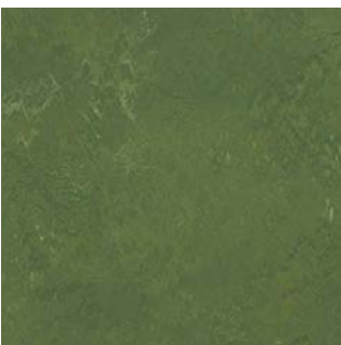
Árbol AD941 LRV 12