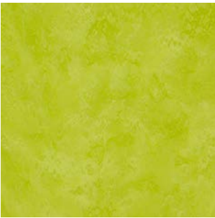
Lima AD939 LRV 43