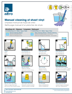
Illus. cleaning guides