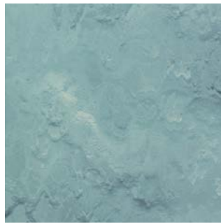
Agua AD523 LRV 35