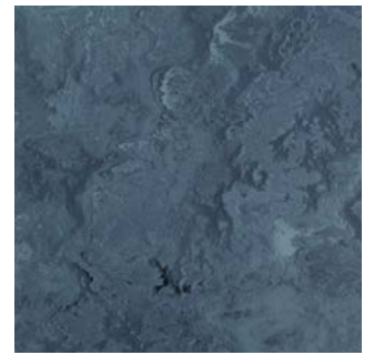
Rio AD524 LRV 15