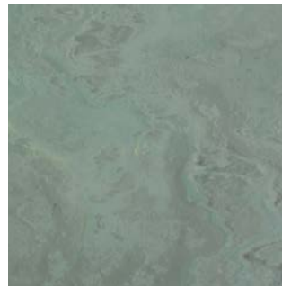
Oceano AD609 LRV 30