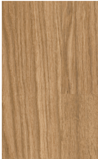
Oak Trad. Comfort WSMSC2807 WR353 / AM225 LRV 25