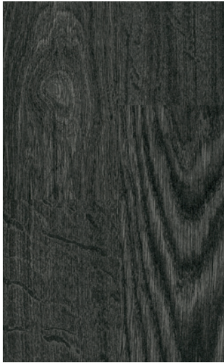
Manor Oak Comfort WSMSC2809 WR348 / AM348 LRV 7