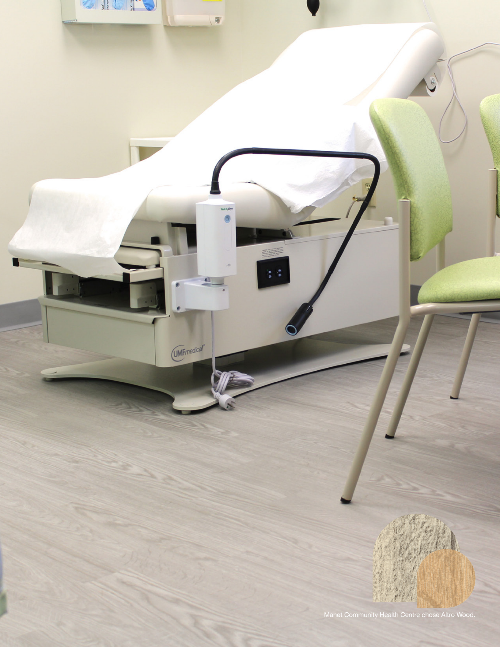
Manet Community Health Centre chose Altro Wood.