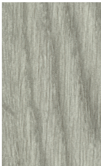
Washed Oak Comfort WSMSC2808 WR347 / AM347 LRV 38