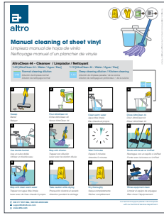
Illus. cleaning guides