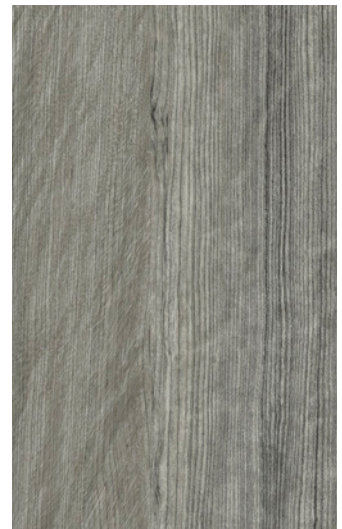
Slate Oak Comfort WSMSC2826 WR478 / AM390 LRV 26

Always approve a physical sample before placing a material order. Image quality can vary and small swatches may not show the full pattern.