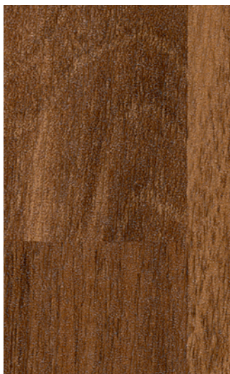
Antique Walnut Comfort WSMSC2810 WR341 / AM160 LRV 15