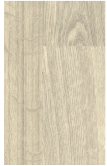
Blchd. Oak Comfort WSMSC2801 WR335 / AM335 LRV 52