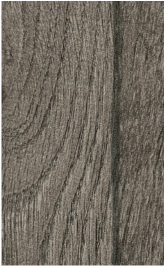
Worn Oak Comfort WSMSC2818 WR322 / AM239 LRV 19