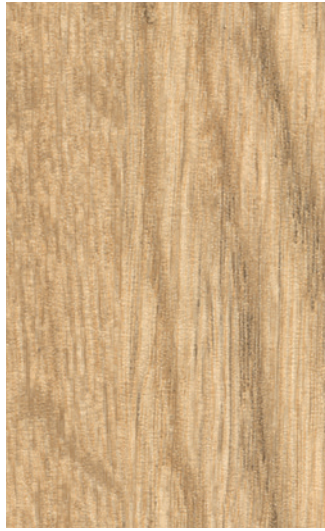
Farmhouse Oak Comfort WSMSC2811 WR338 / AM338 LRV 38