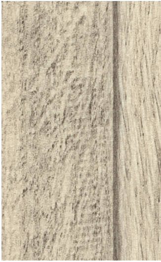
Castle Oak Comfort WSMSC2816 WR335 / AM335 LRV 51