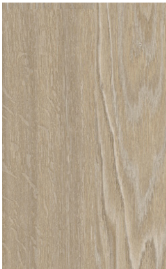
Sessile Oak Comfort WSMSC2823 WR350 / AM483 LRV 30