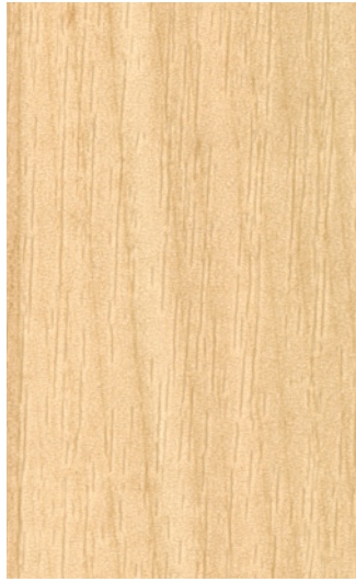
Honey Beech Comfort WSMSC2829 WR462 / AM462 LRV 43