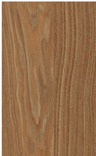
Honey Oak Comfort WSMSC2825 WR352 / AM352 LRV 21