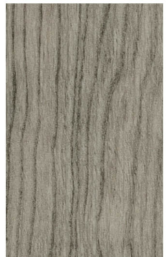
Vintage Cherry Comfort WSMSC2803 WR336 / AM239 LRV 22

Always approve a physical sample before placing a material order. Image quality can vary and small swatches may not show the full pattern.