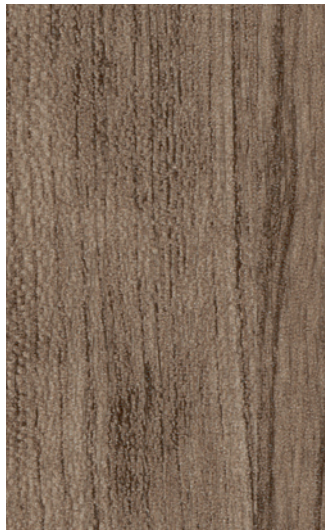
Urban Cherry Comfort WSMSC2804 WR337 / AM337 LRV 17