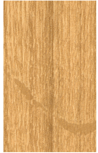
Rustic Oak Comfort WSMSC2805 WR340 / AM340 LRV 37