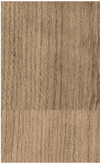
Autumn Maple Comfort WSMSC2802 WR339 / AM339 LRV 24