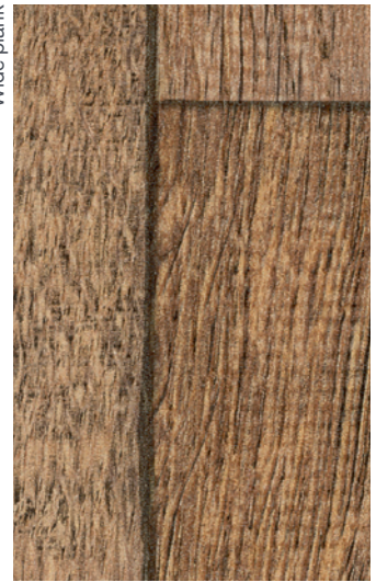
Great Oak Comfort WSMSC2817 WR339 / AM339 LRV 22