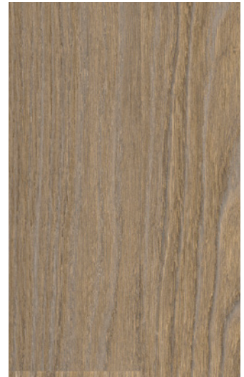
Bavarian Oak Comfort WSMSC2822 WR514 / AM514 LRV 21