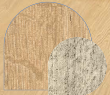
Salisbury Hospital chose Altro Wood.