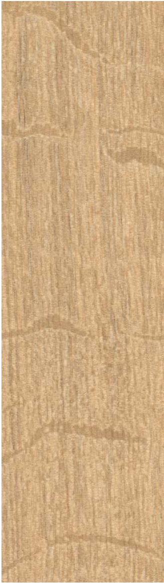
Farmhouse Oak Acoustic WSMA3781 WR338 / AM338 LRV 38