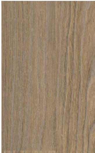
Bavarian Oak Acoustic WSMA37104 WR514 / AM514 LRV 21