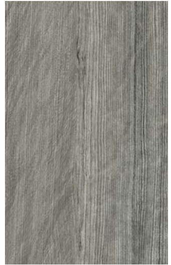
Slate Oak Acoustic WSMA37108 WR478 / AM390 LRV 26