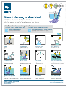
Illus. cleaning guides