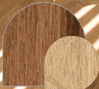
Colors shown: Antique Walnut and Farmhouse Oak