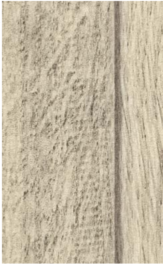
Castle Oak Acoustic WSMA3798 WR335 / AM335 LRV 51