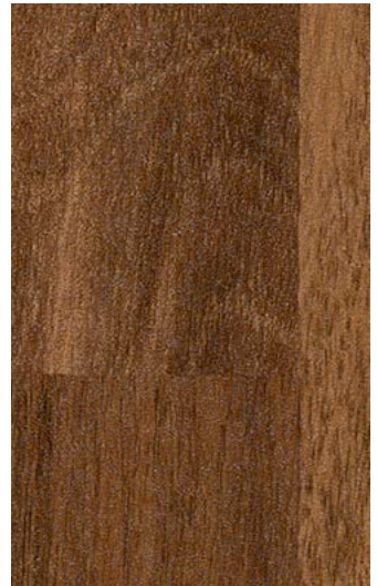
Antique Walnut Acoustic WSMA3782 WR341 / AM160 LRV 15