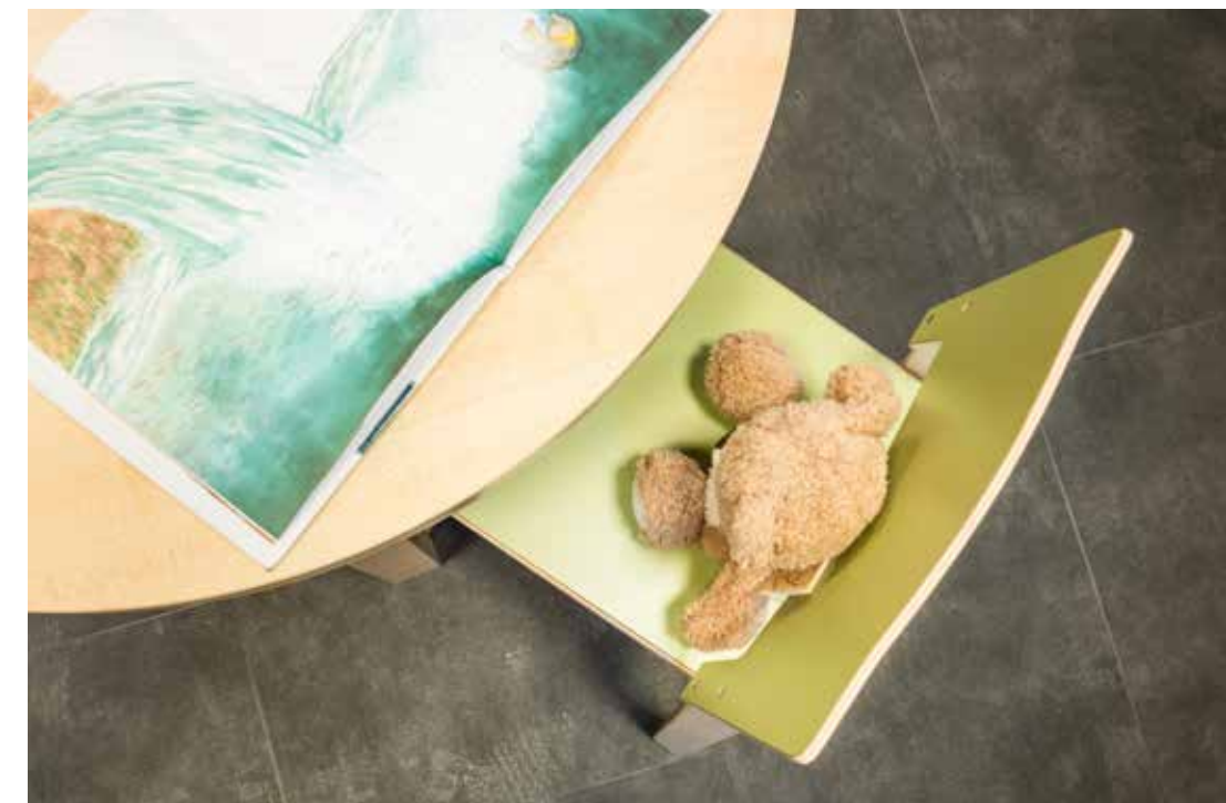
1. Altro Ensemble™