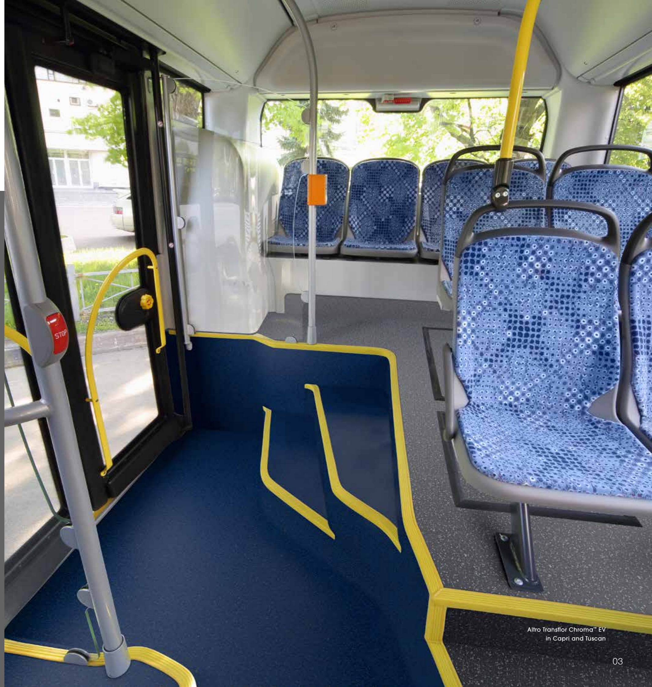
Altro Transflor Chroma™ EV in Capri and Tuscan

By identifying and addressing key industry challenges, Altro has created its hardest working floors for the hardest working vehicles. Why compromise on weight or performance when you can enjoy the benefits of both?