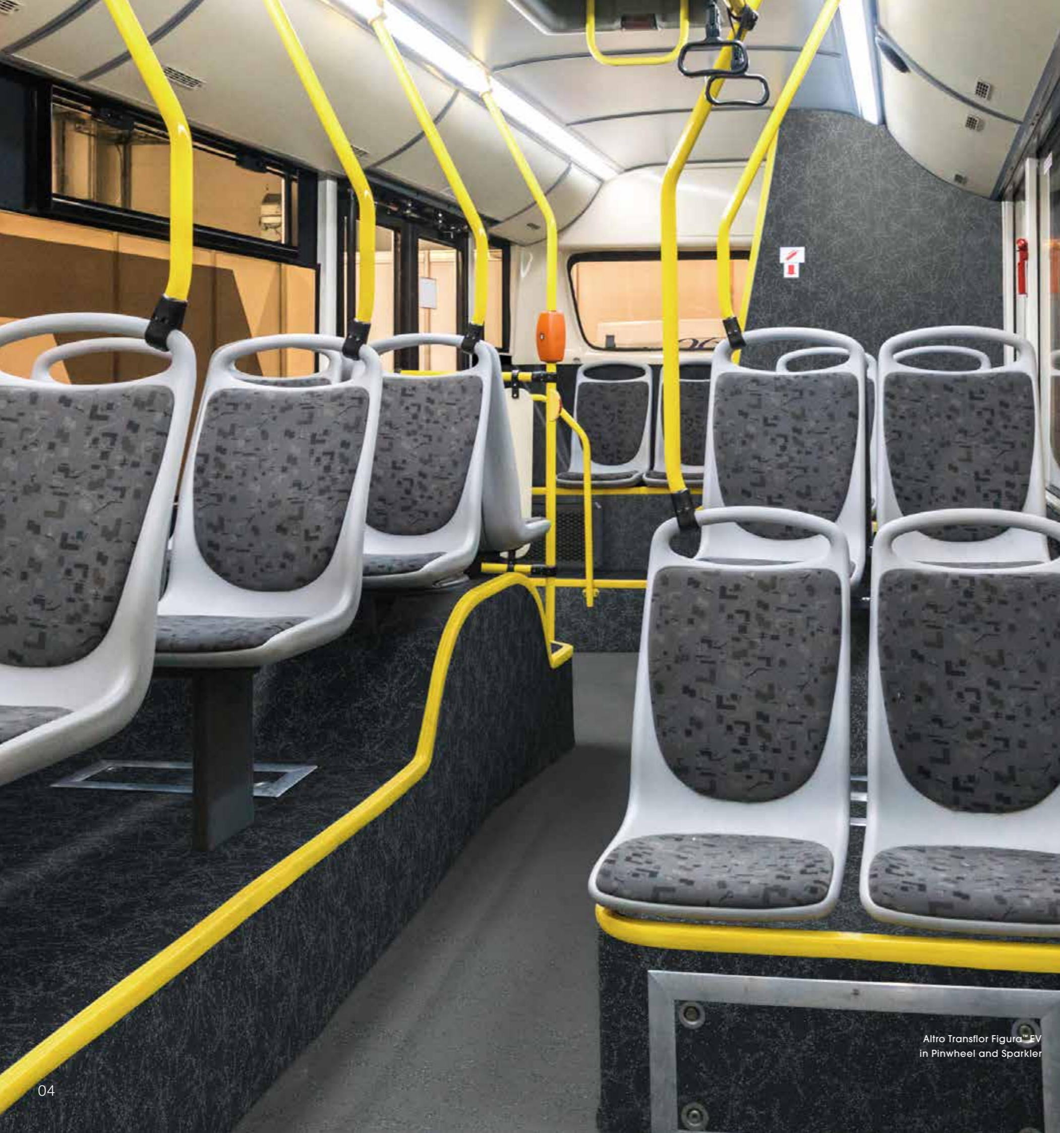
Altro Transflor Figura™ EV in Pinwheel and Sparkler