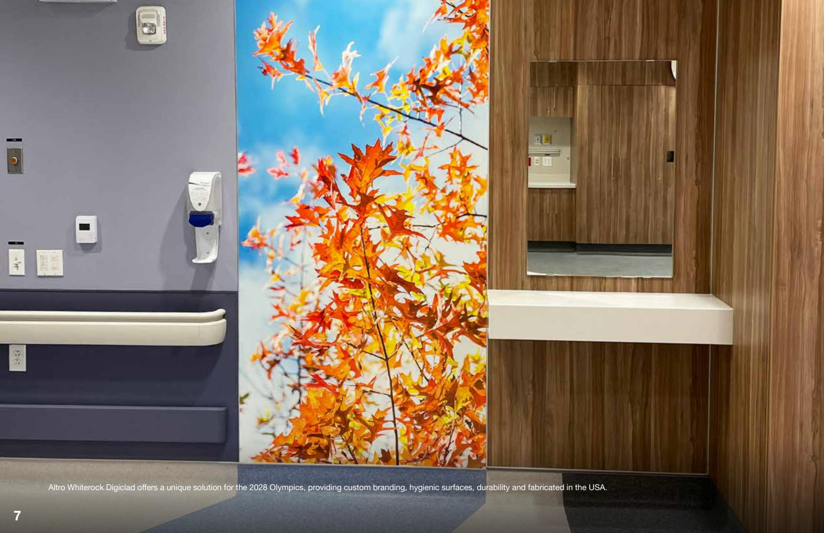
Altro Whiterock Digiclad offers a unique solution for the 2028 Olympics, providing custom branding, hygienic surfaces, durability and fabricated in the USA.