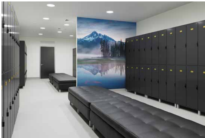
For temporary installations, Altro Whiterock panels can be easily installed with a Velcro backing. This approach allows the panels to be quickly removed and repurposed as needed.